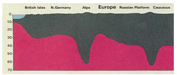
Figure 2: Schematic section. The mountains, like pegs, have deep roots embedded in the ground. (Anatomy of the Earth, Cailleux, p. 220.)

Figure 1: Mountains have deep roots under the surface of the ground. (Earth, Press and Siever, p. 413.)